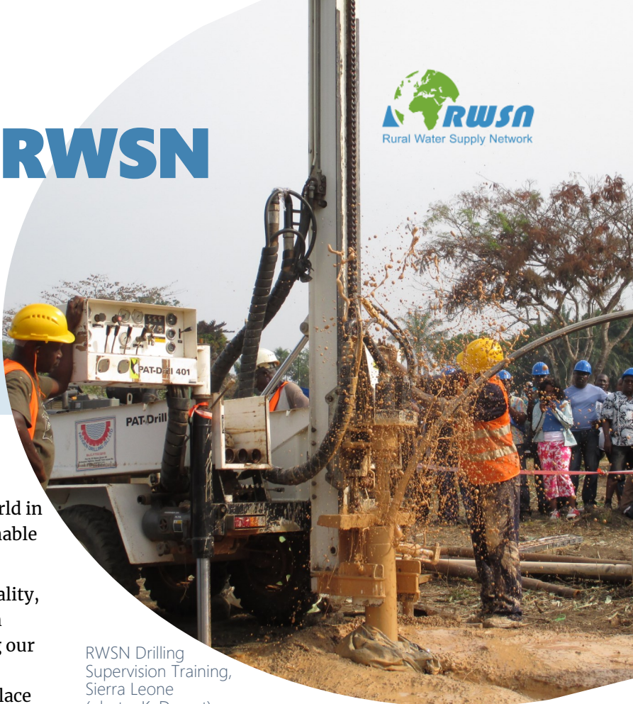
RWSN Drilling Supervision Training, Sierra Leone

the global knowledge network for practical professionalism in rural water supply